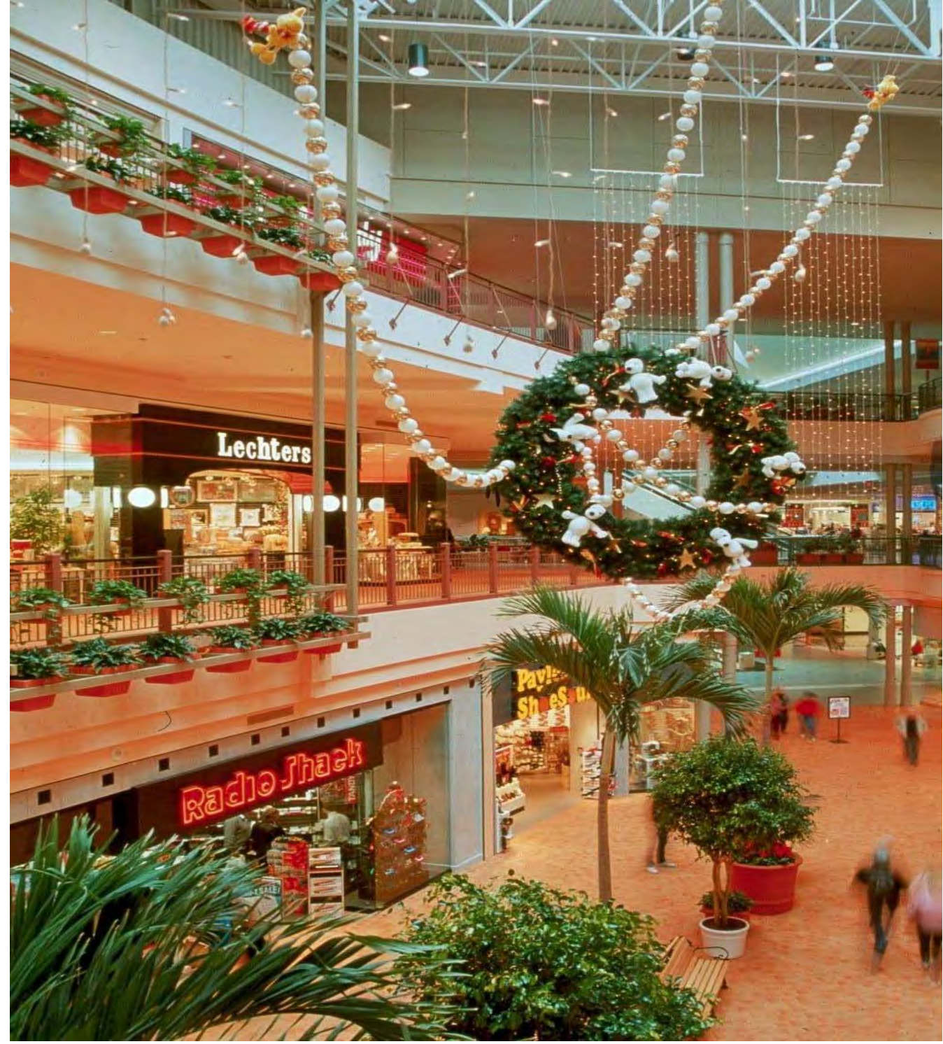
Mall of America - Minnesota