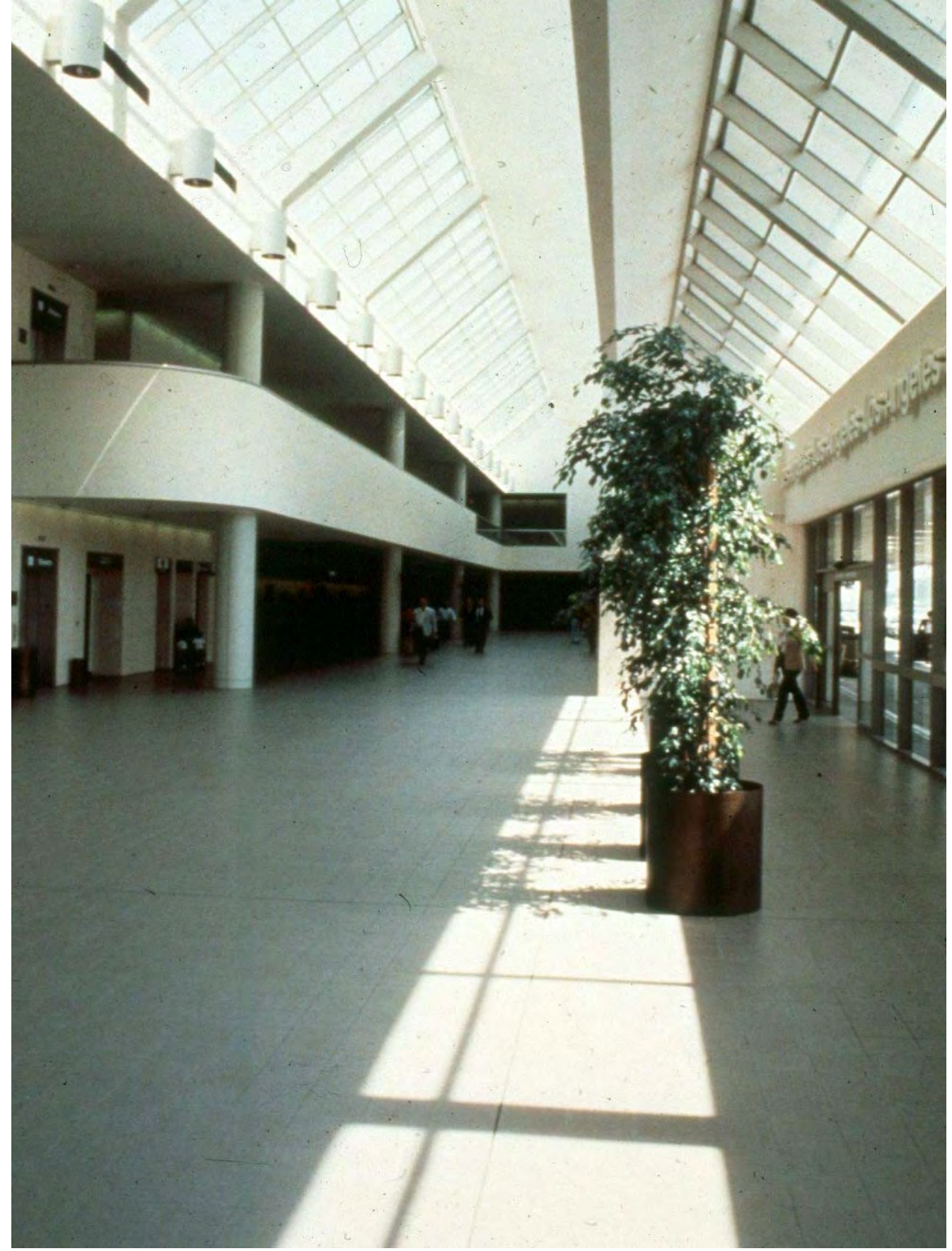
Los Angeles Airport