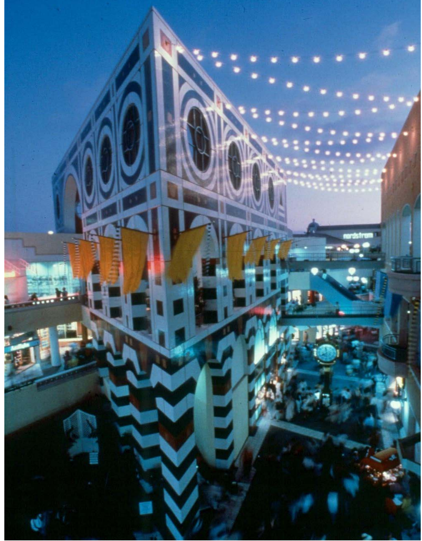
Horton Plaza – San Diego