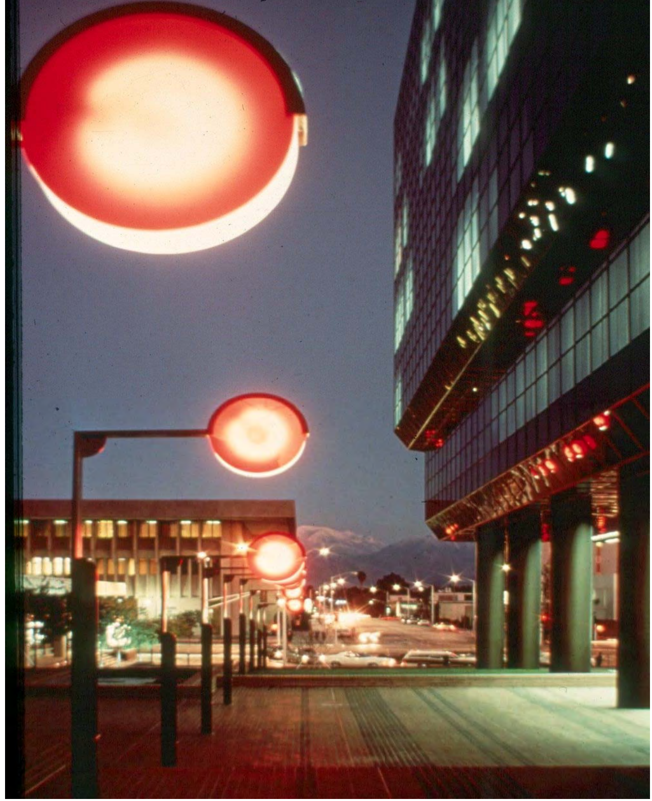
San Bernardino City Hall