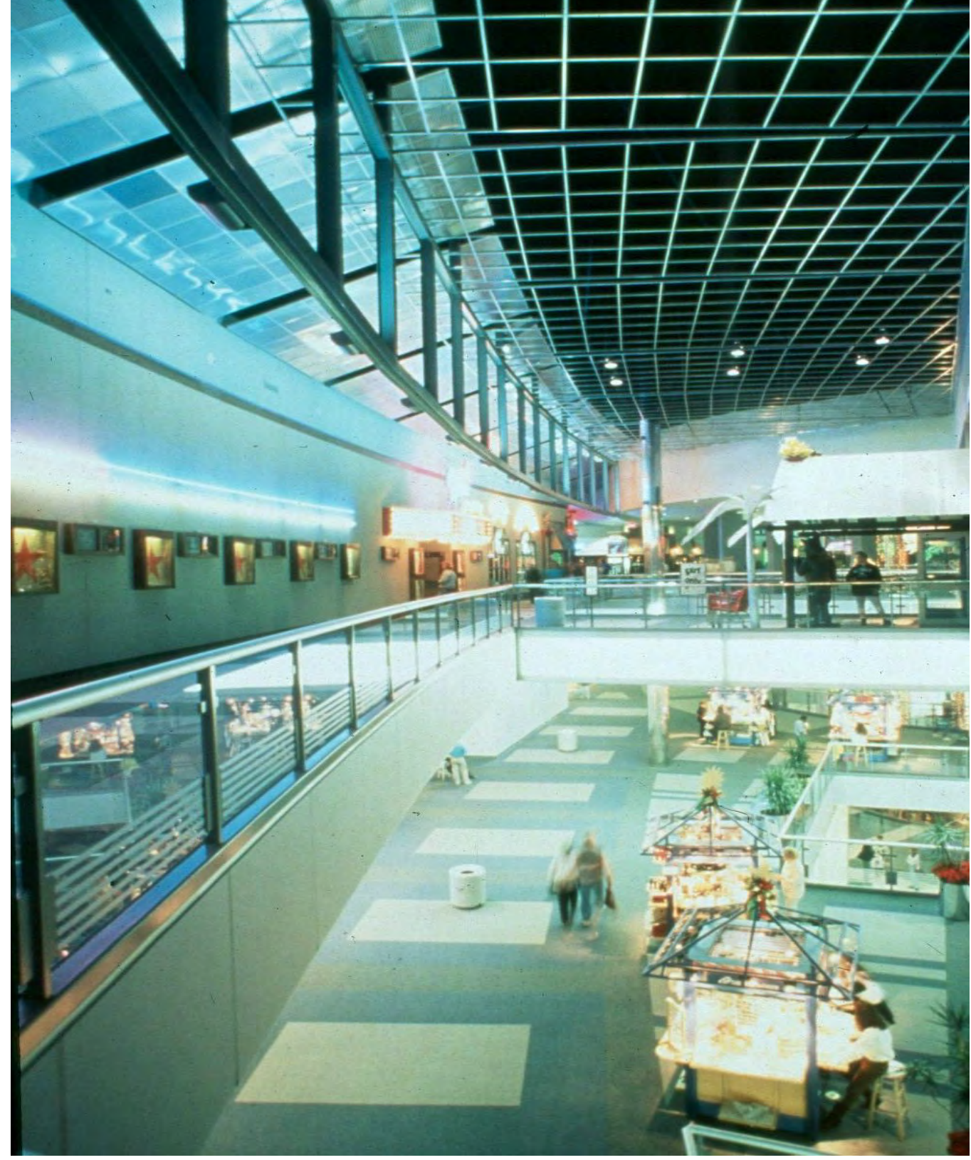
Mall of America - Minnesota