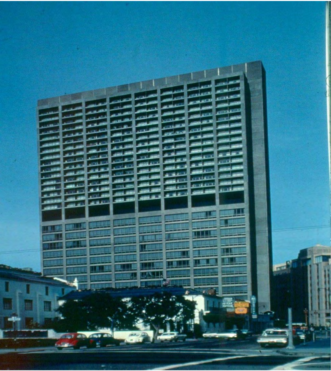
Fox Plaza – San Francisco