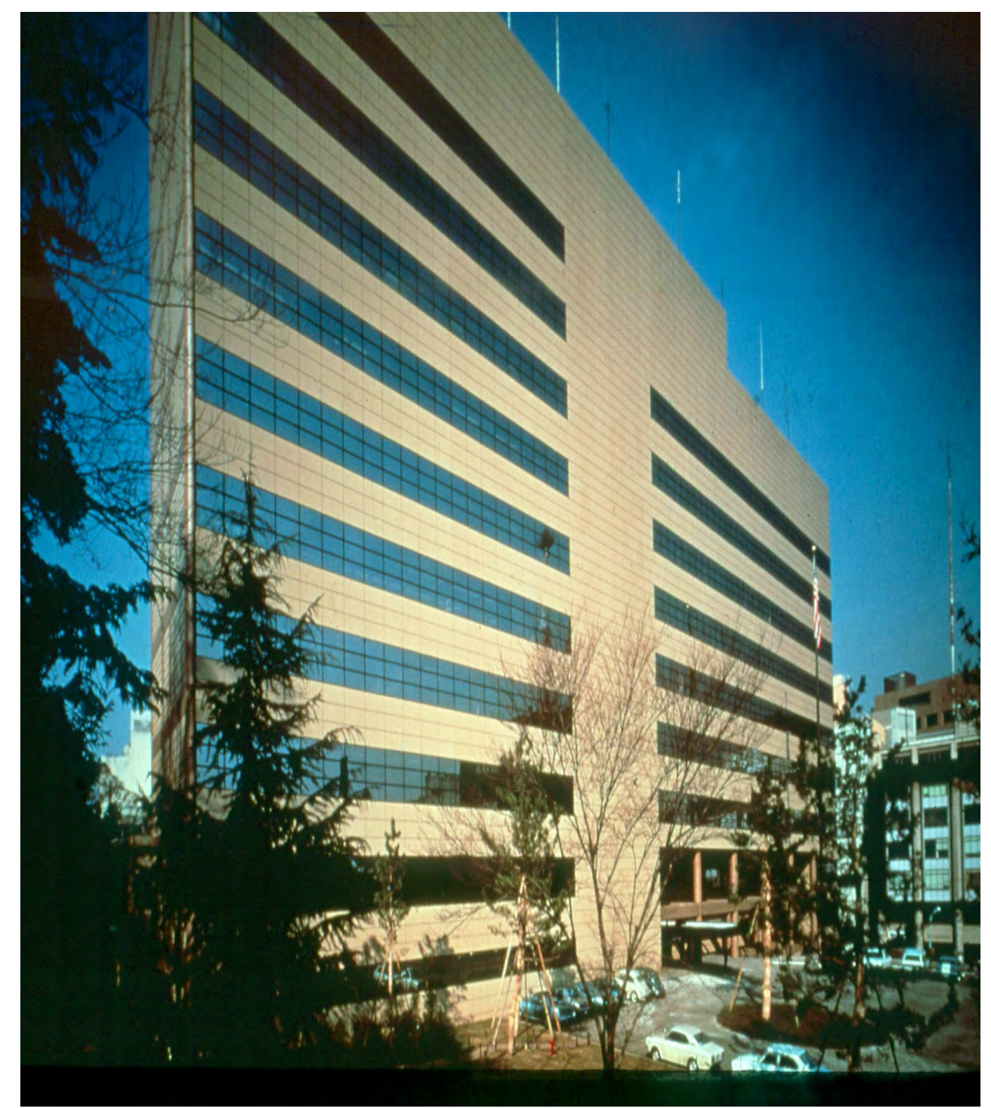
Tokyo US Embassy