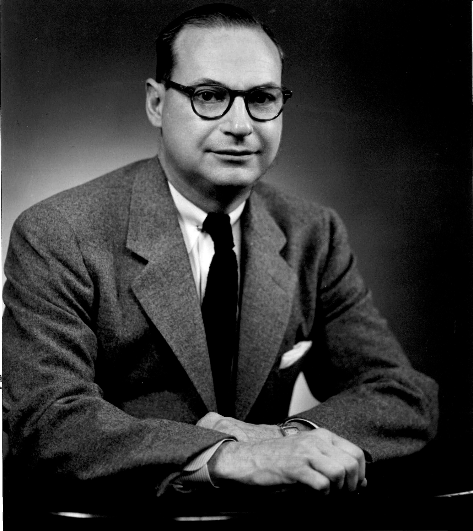
# 35 SARGENT 96-

THE AMERICAN INSTITUTE OF ARCHITECTS ARCHIVES For information or study purposes only. Not to be recopied, quoted, or published without written permission from the AIA Archives, 1735 New York Ave. NW, Washington, DC 20006