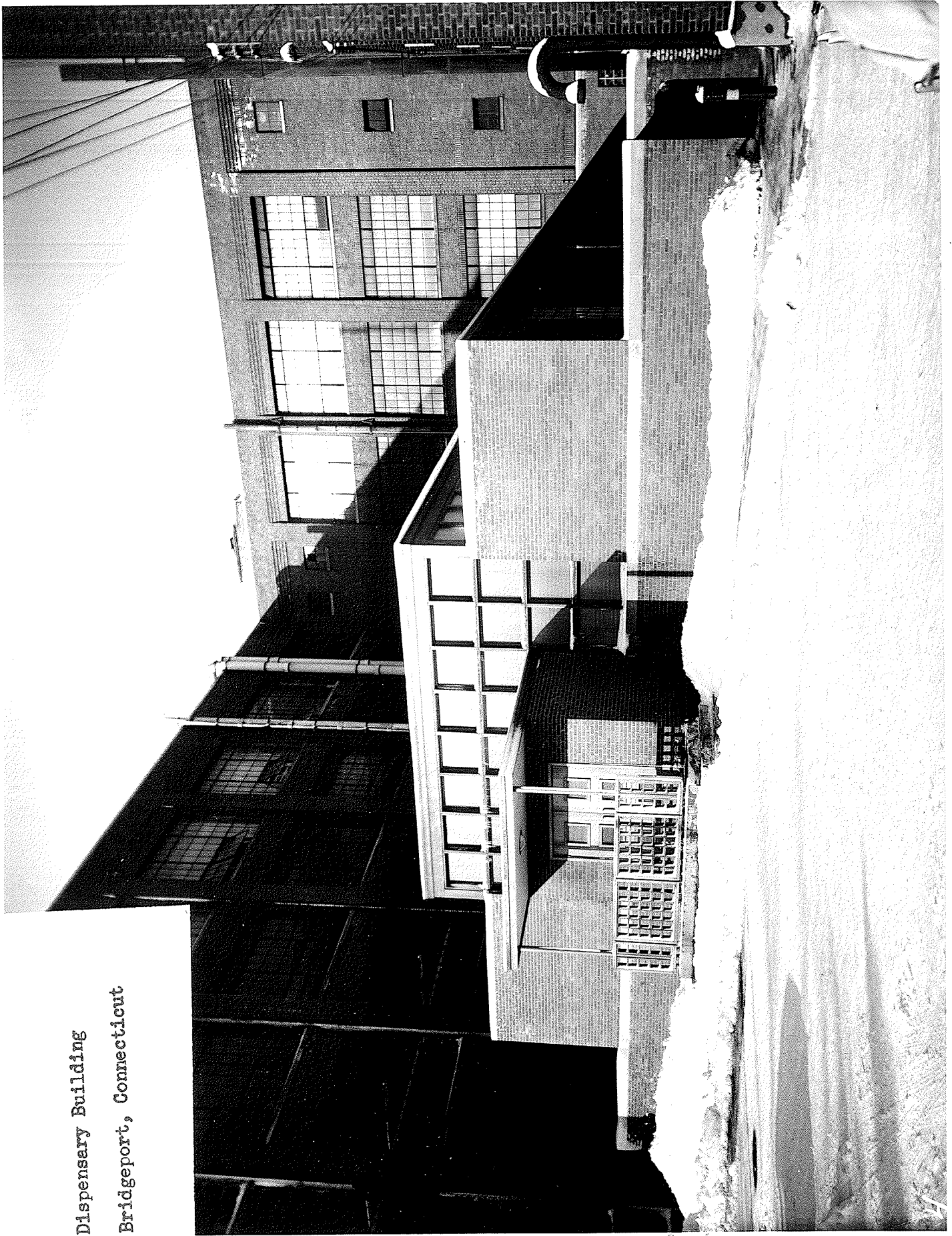
Dispensary Building Bridgeport, Connecticut