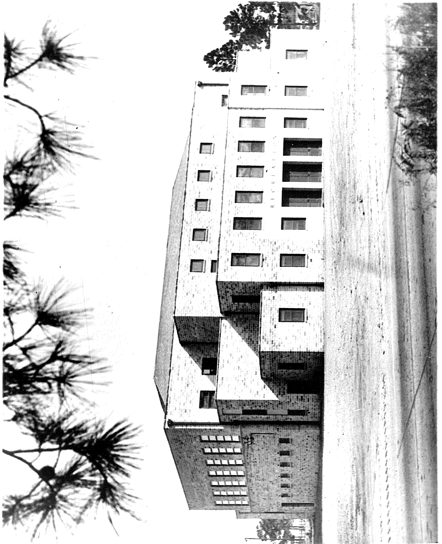
Recreation Building (Fireproof) City of Pascagoula, Mississippi