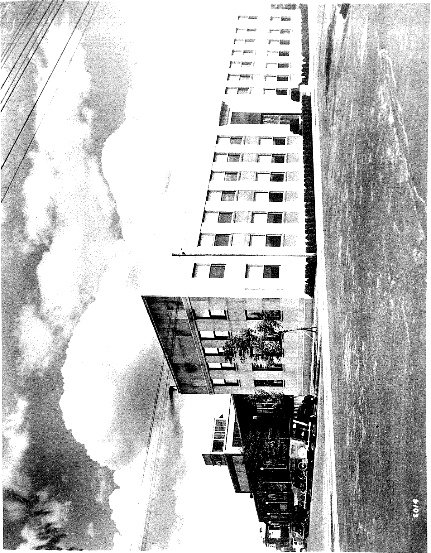
Research Laboratory Building (Fireproof) Swann and Company Birmingham, Alabama

THE AMERICAN INSTITUTE OF ARCHITECTS ARCHIVES For information or study purposes only. Not to be recycled, quoted, or published without written permission from the AIA Archives, 1735 New York Ave. NW, Washington, DC 20006