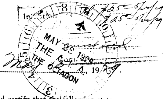
Exhibit to Record