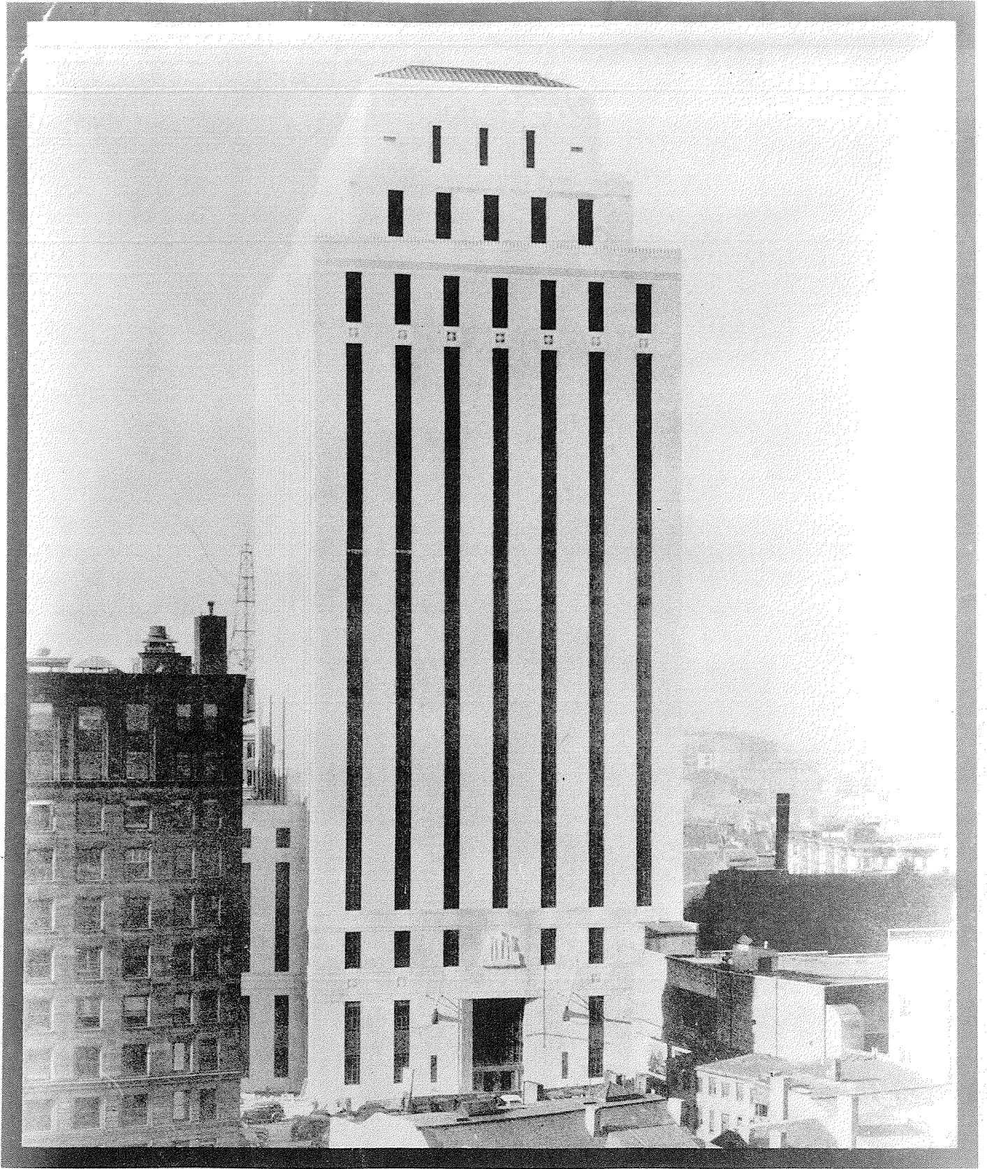
SUFFOLK COUNTY COURTHOUSE, BOSTON, MASS.