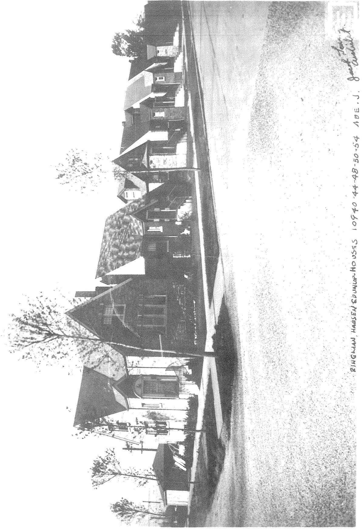
BINGLIAN, HANSEN & JUNIOR HOUSES 10970 44-48-50-54 ADE. J.