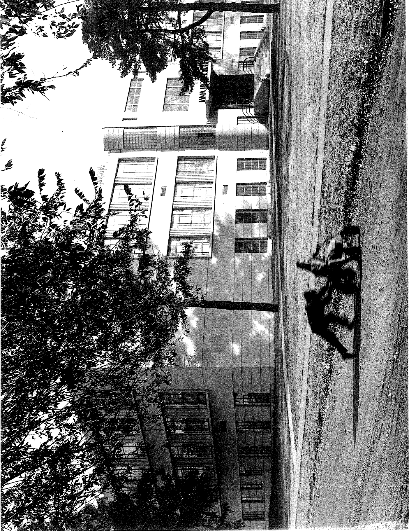
THE AMERICAN INSTITUTE OF ARCHITECTS ARCHIVES For information or study purposes only. Not to be recycled, quoted, or published without written permission from the AIA Archives, 1735 New York Ave. NW, Washington, DC 20006