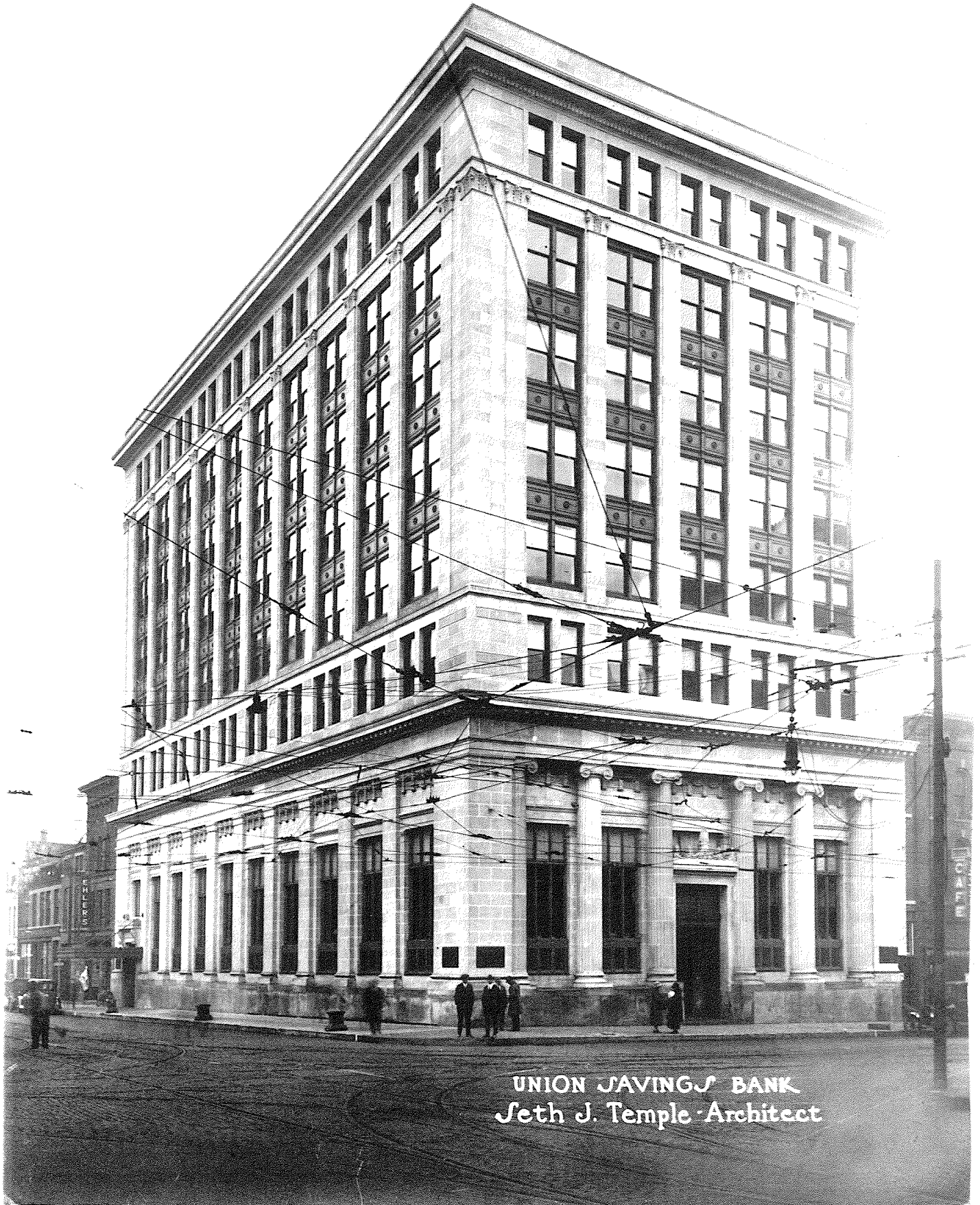
UNION SAVINGS BANK Seth J. Temple Architect

THE AMERICAN INSTITUTE OF ARCHITECTS ARCHIVES For information or study purposes only. Not to be recycled, quoted, or published without written permission from the AIA Archives, 1735 New York Ave. NW, Washington, DC 20006