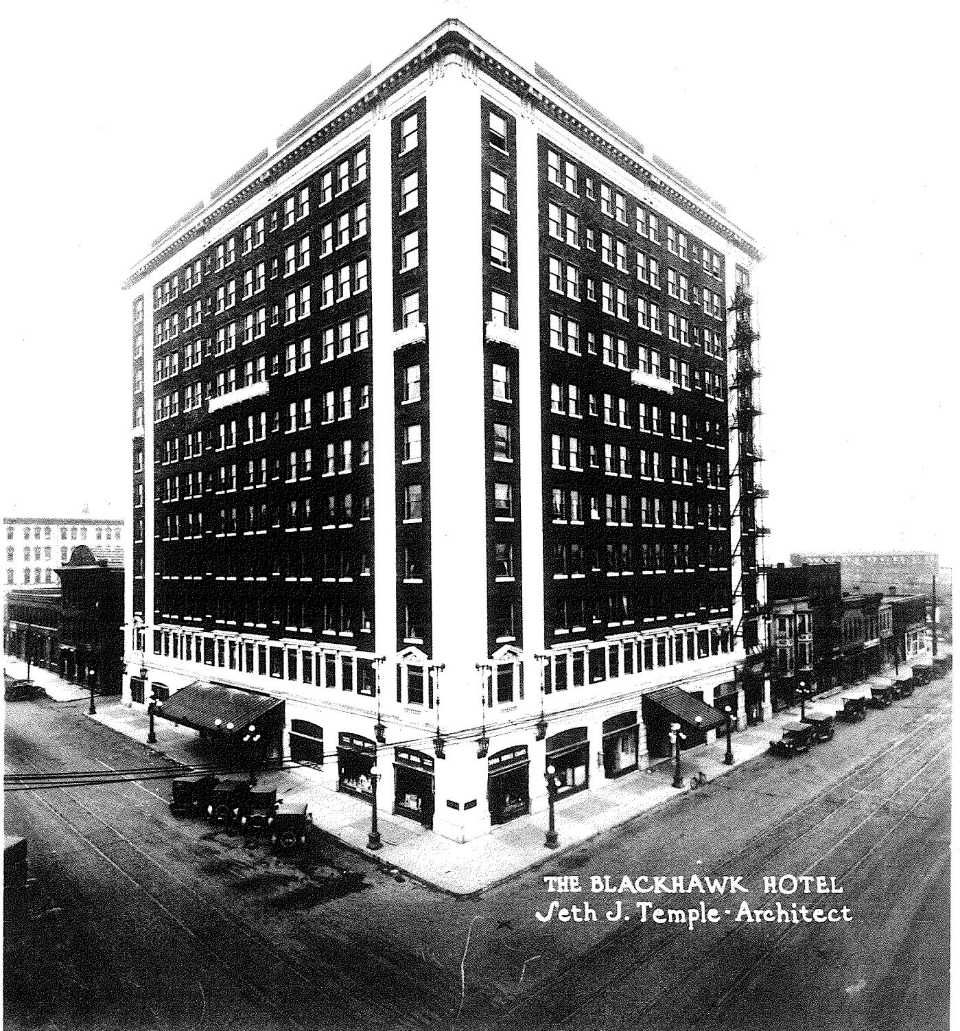
THE BLACKHAWK HOTEL Seth J. Temple Architect

THE AMERICAN INSTITUTE OF ARCHITECTS ARCHIVES For information or study purposes only. Not to be recycled, quoted, or published without written permission from the AIA Archives, 1735 New York Ave. NW, Washington, DC 20006