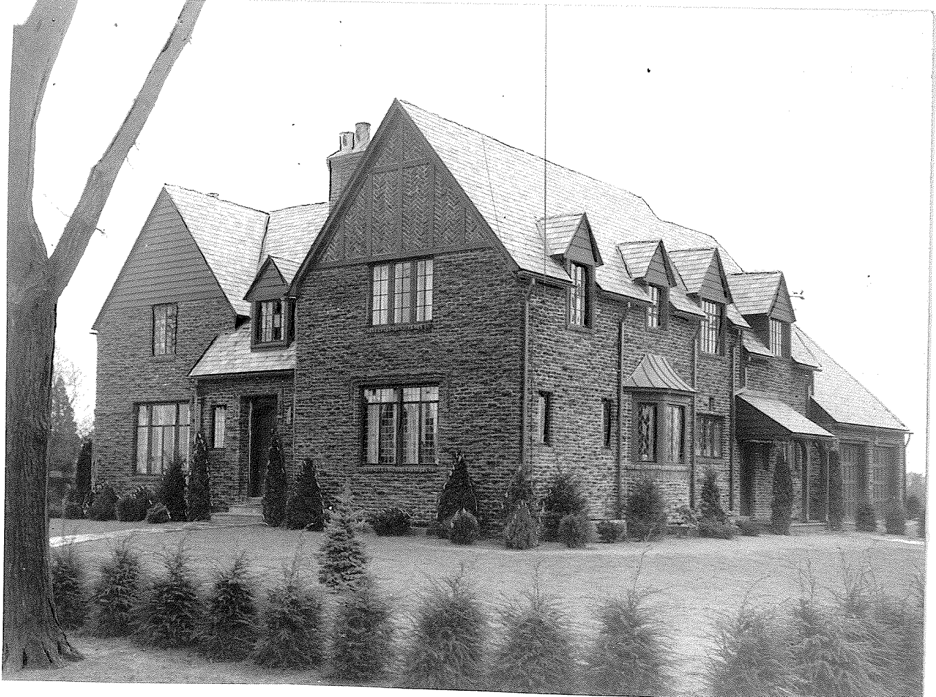
THE AMERICAN INSTITUTE OF ARCHITECTS ARCHIVES For information or study purposes only. Not to be recycled, quoted, or published without written permission from the AIA Archives, 1735 New York Ave. NW, Washington, DC 20006