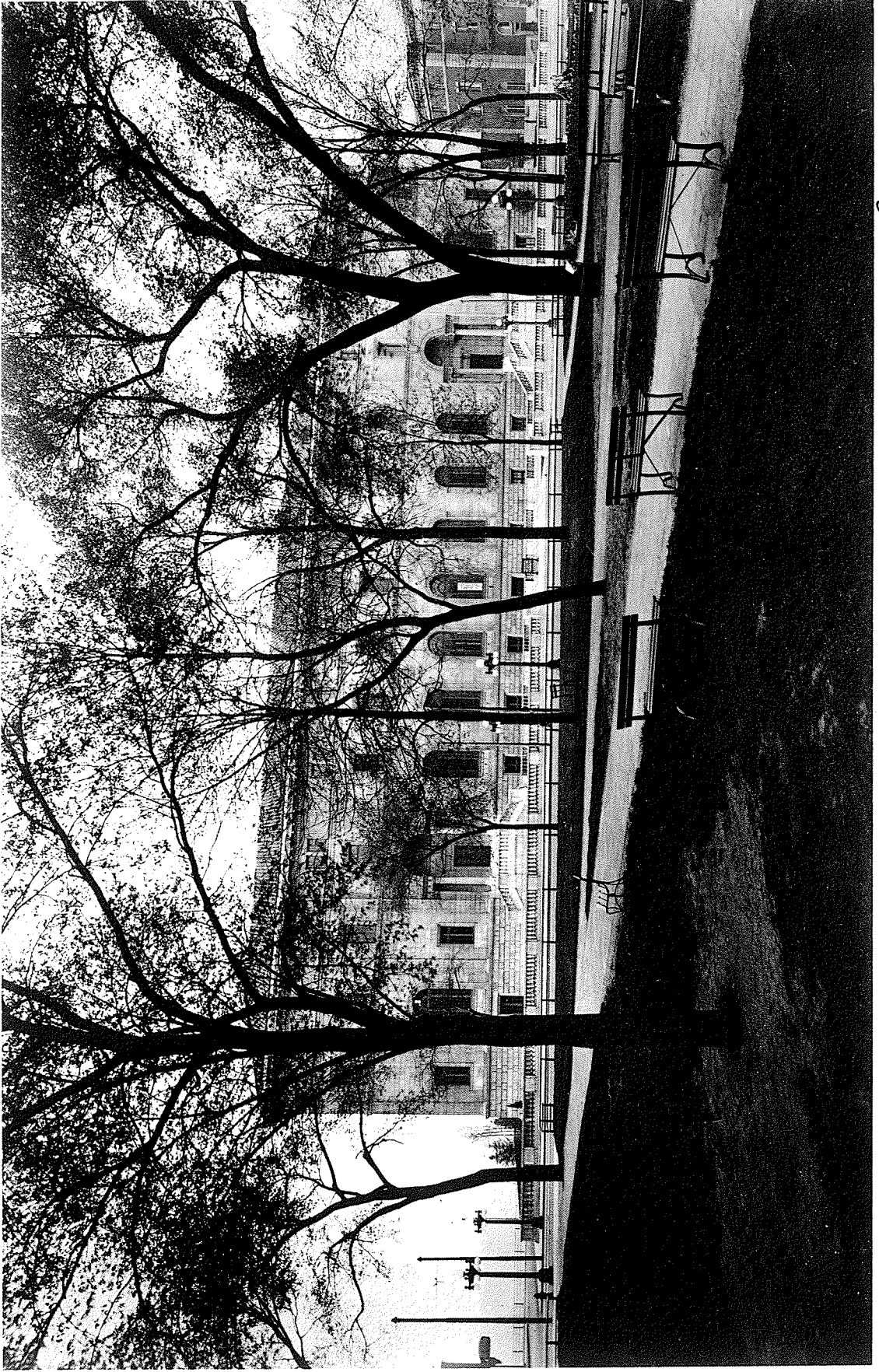
Elston O'Shea, Architect