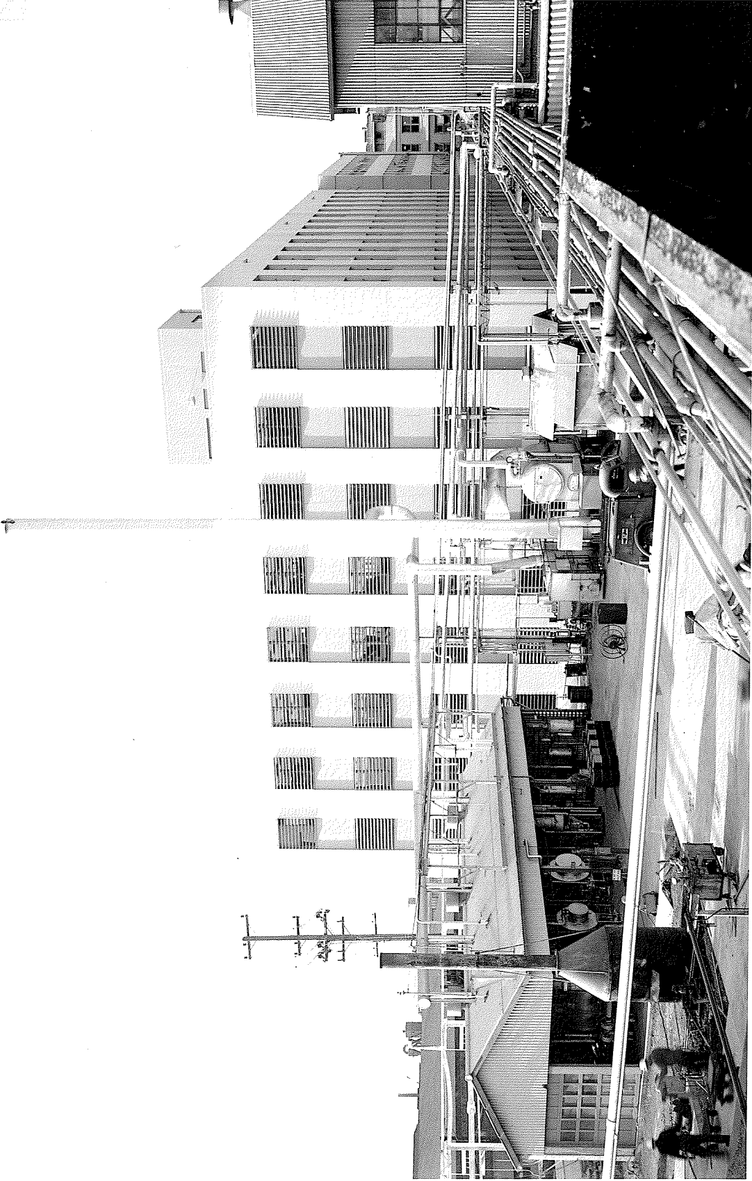
OFFICE BUILDING, EMERYVILLE, CAL. SHELL DEVELOPMENT. JEDY A. LIBBIN & CO., ARCHT.