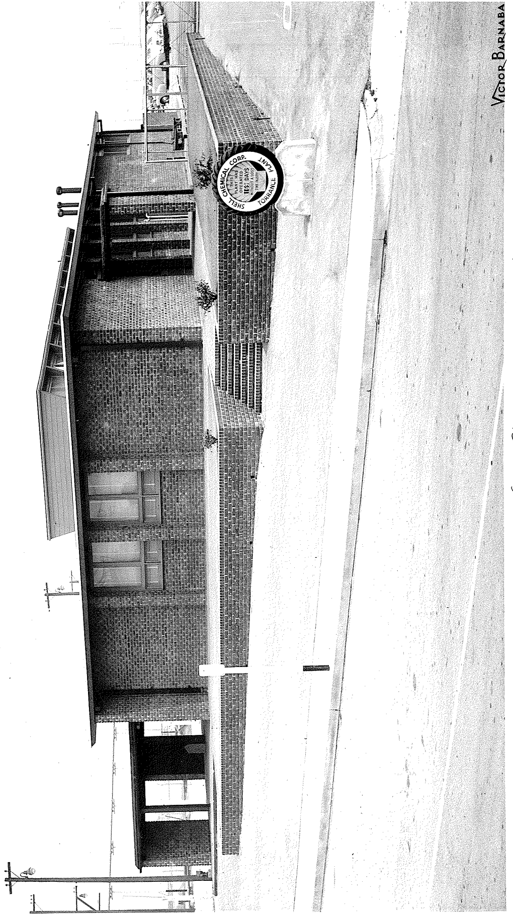
SHELL CHEMICAL. TORRANCE. KAUFMANN ASSOCIATES.