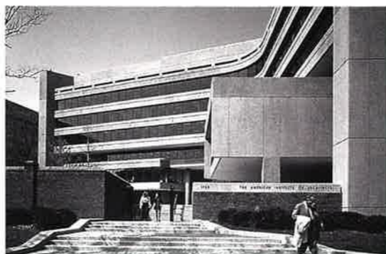
A.I.A. Headquarters Building

We listen to the client, exploring their needs, expectations and resources. We listen to the place, immersing ourselves in the singular characteristics of the project's site and the natural forces and formal vocabulary of its physical context. And we listen to the users who will actually be living with the building, enriching our understanding of how the building will work best."