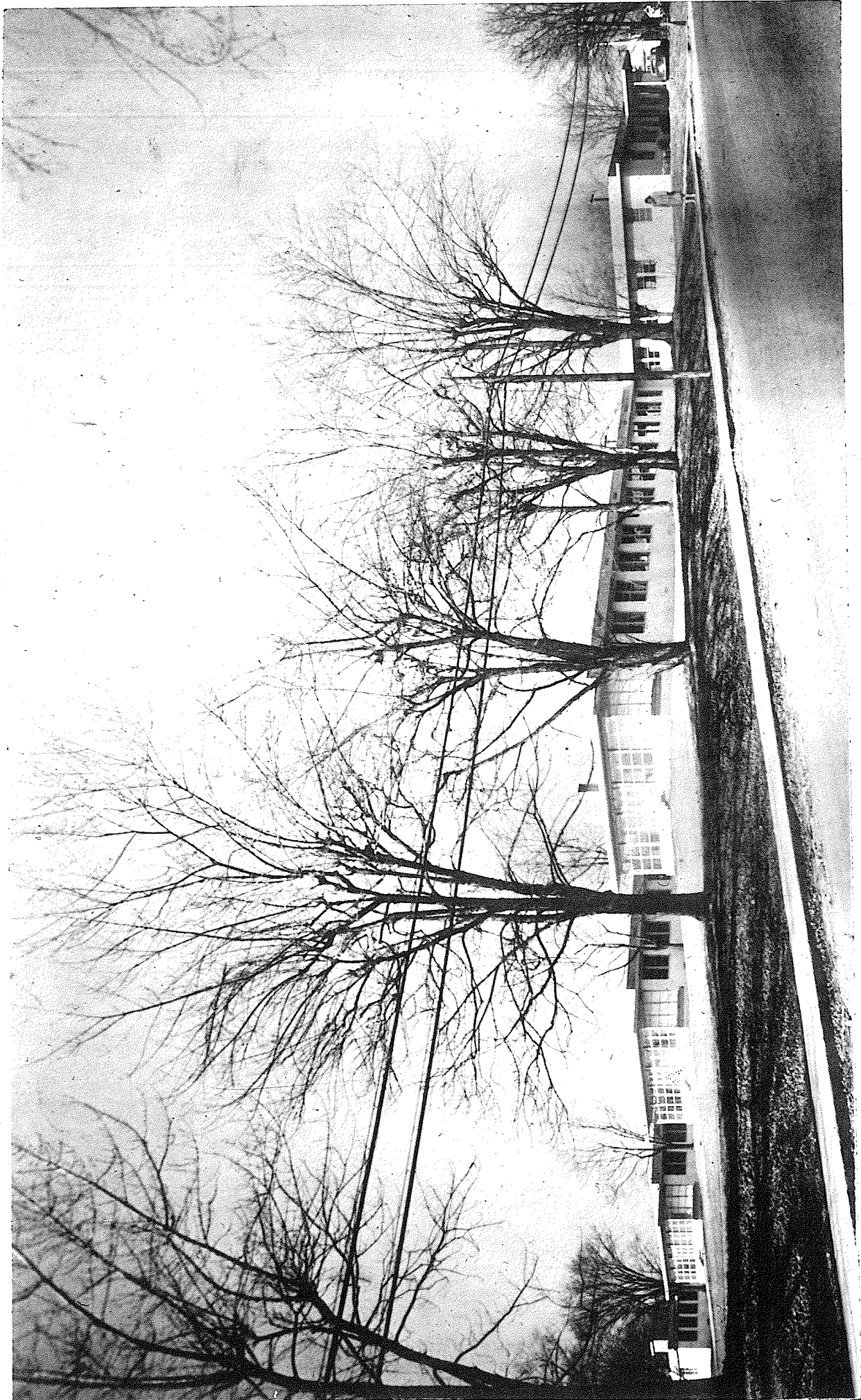
THE AMERICAN INSTITUTE OF ARCHITECTS ARCHIVES For information or study purposes only. Not to be recycled, quoted, or published without written permission from the AIA Archives, 1735 New York Ave. NW, Washington, DC 20006