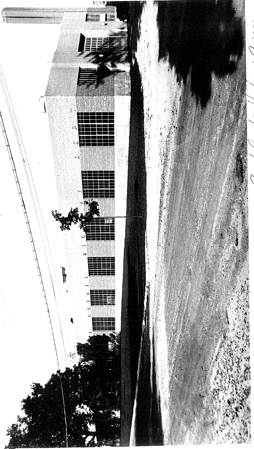
Grant County Highway Garage. Lancaster, Wisconsin.

THE AMERICAN INSTITUTE OF ARCHITECTS ARCHIVES For information or study purposes only. Not to be recycled, quoted, or published without written permission from the AIA Archives, 1735 New York Ave. NW, Washington, DC 20006