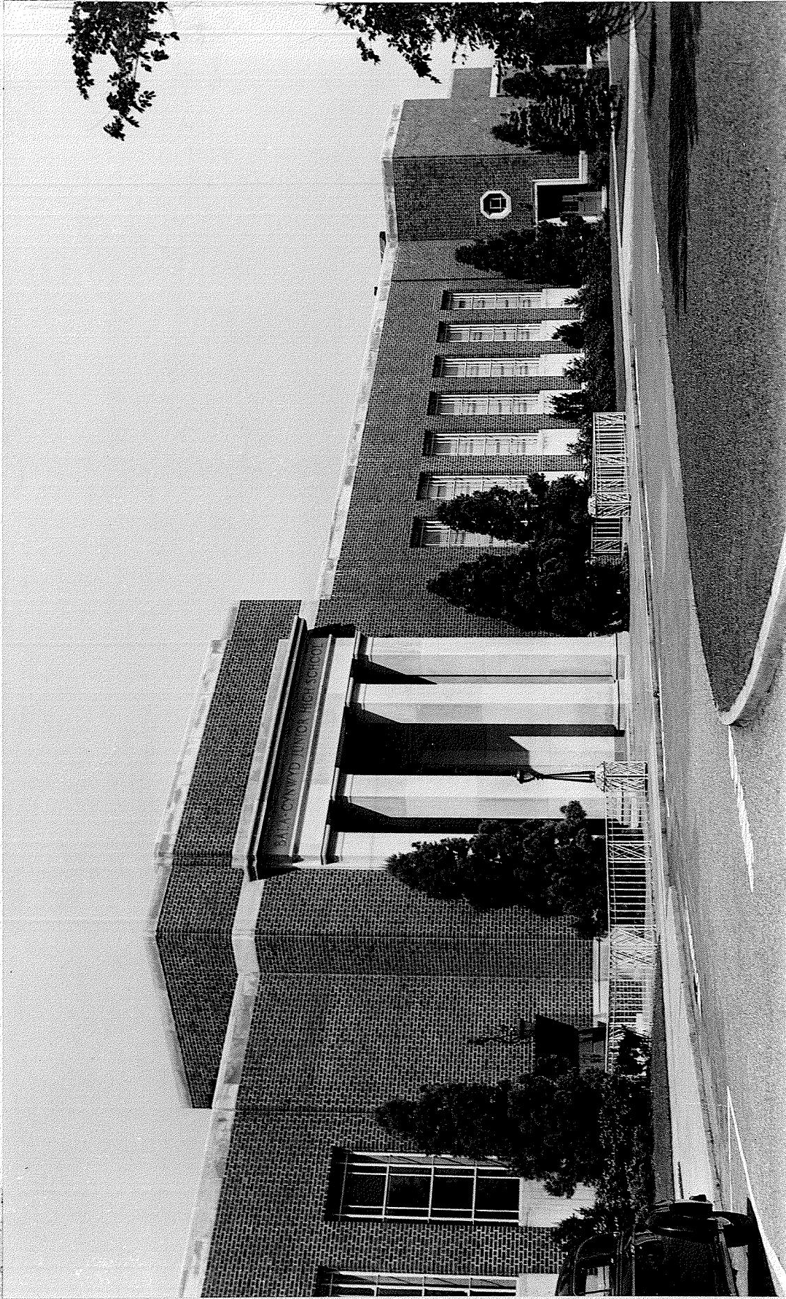
Facing Bryn Mawr Avenue. Bala-Cynwyd Junior High School. Cynwyd, Penna.

THE AMERICAN INSTITUTE OF ARCHITECTS ARCHIVES. For information or study purposes only. Not to be recycled, quoted, or published without written permission from the AIA Archives, 1735 New York Ave. NW, Washington, DC 20006