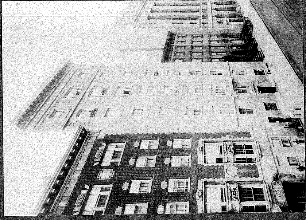
150 East 35th St New York City