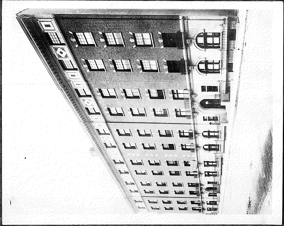
Clarendon Avenue 189-191 New York City

THE AMERICAN INSTITUTE OF ARCHITECTS' ARCHIVES. For information or study purposes only. Not to be reprinted, copied, or published without written permission from the AIA Archives, 1735 New York Ave. NW, Washington, DC 20005