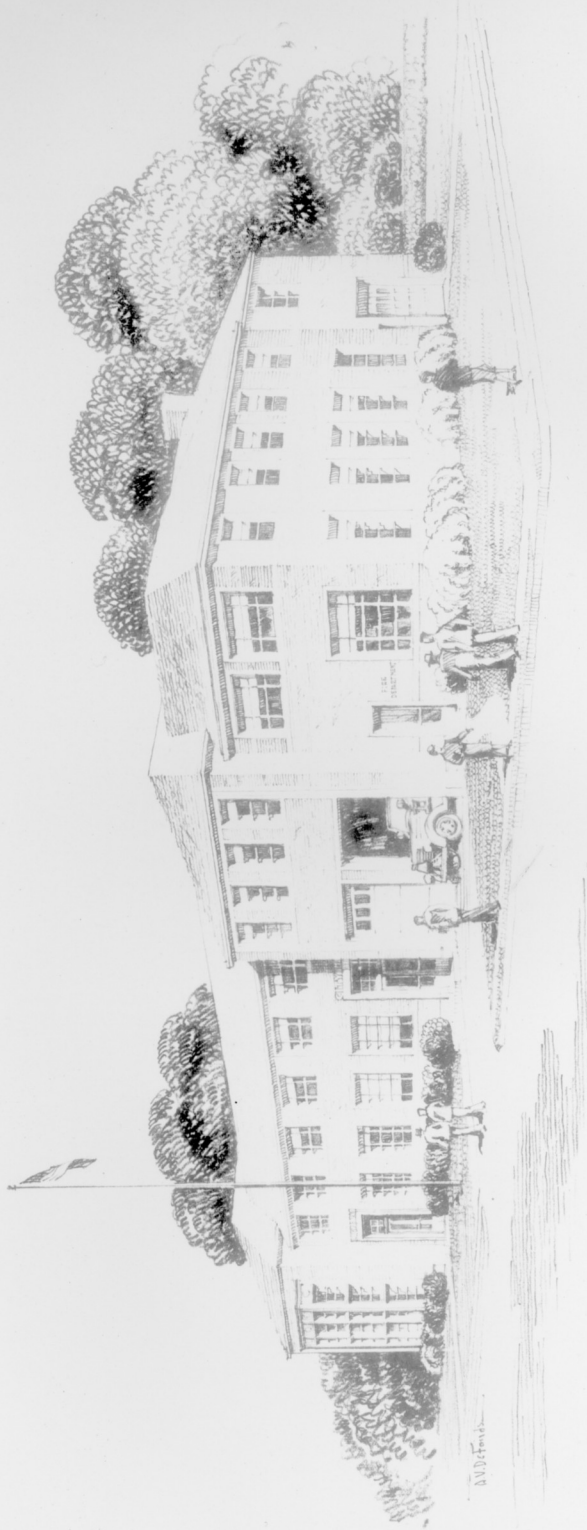
PROPOSED CITY HALL AND MUNICIPAL BUILDING EAST LANSING, MICHIGAN

LEE BLACK AND KENNETH C. BLACK, ARCHITECTS LANSING, MICHIGAN. 5-20-46