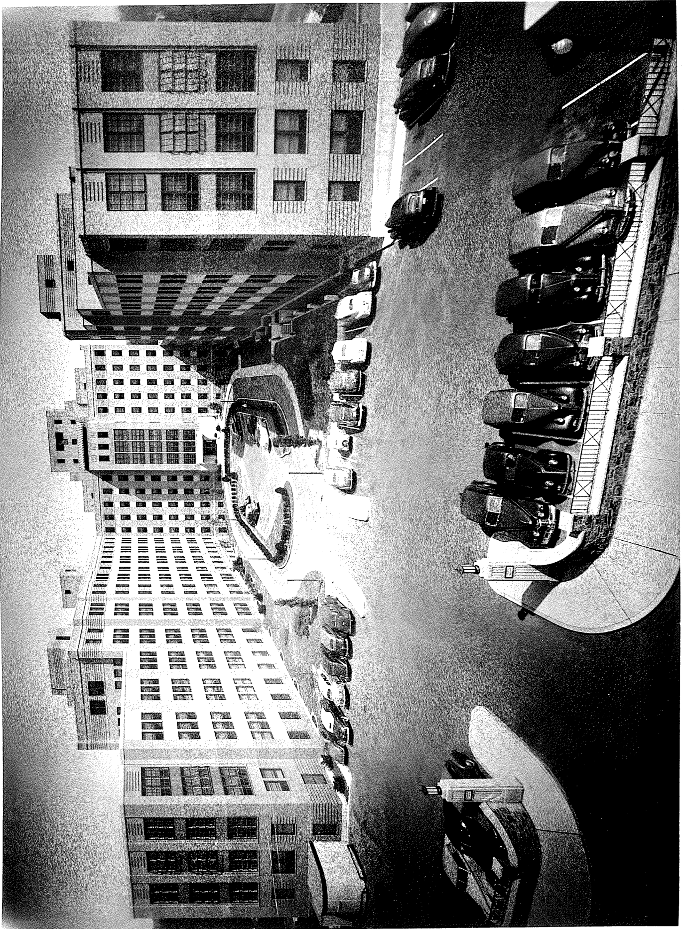
Delaware Hospital Wilmington, Delaware