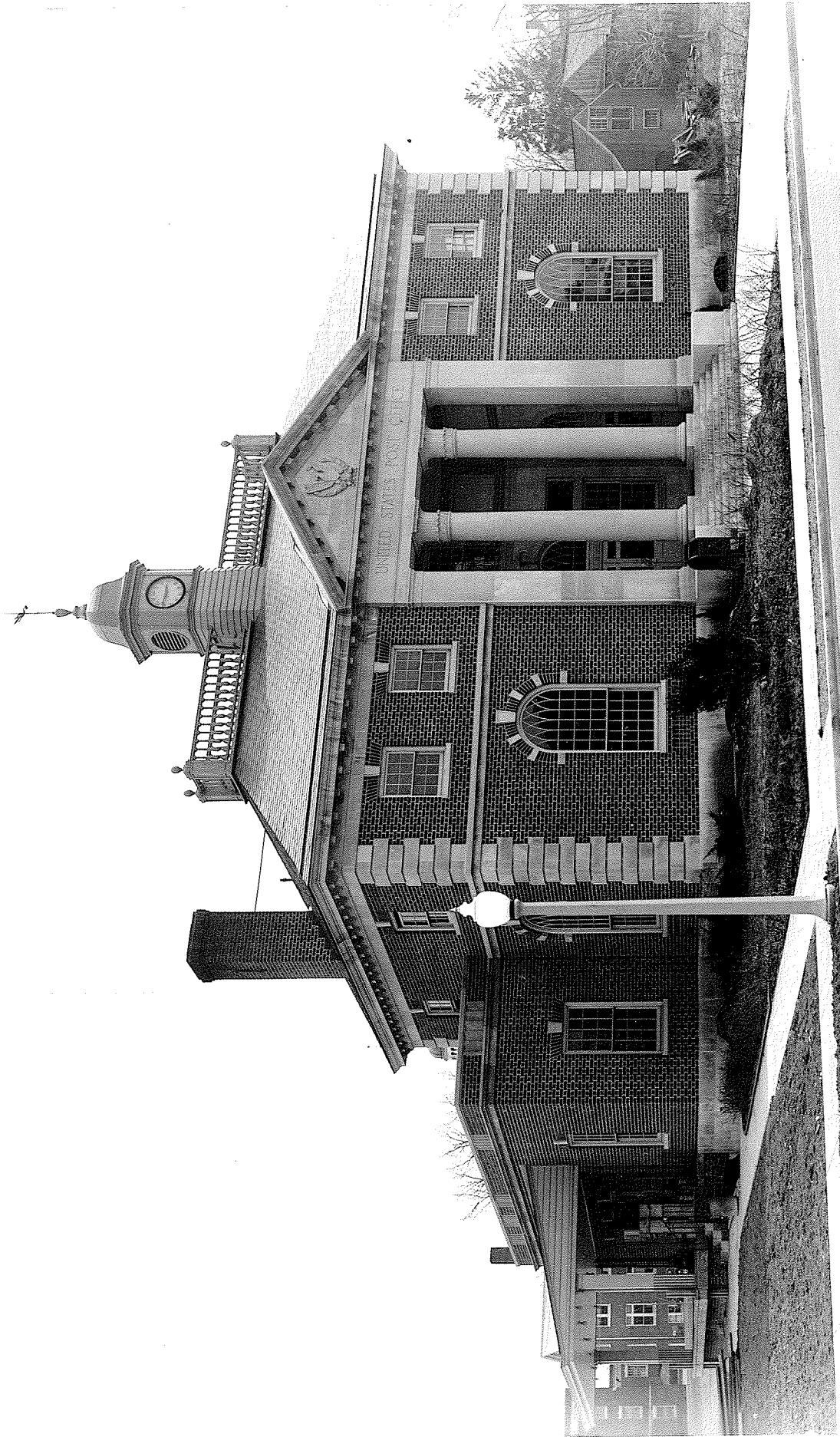
United States Post Office & Federal Building Dover, Delaware

THE AMERICAN INSTITUTE OF ARCHITECTS ARCHIVES For information or study purposes only. Not to be recycled, quoted, or published without written permission from the AIA Archives, 1735 New York Ave. NW, Washington, DC 20006