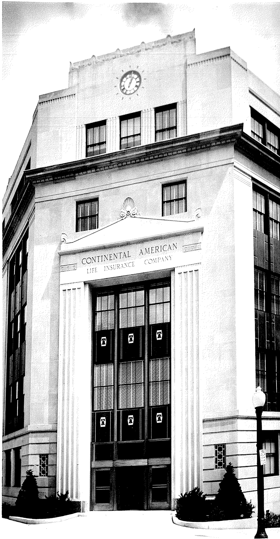
Entrance Detail Continental American Building Wilmington, Delaware