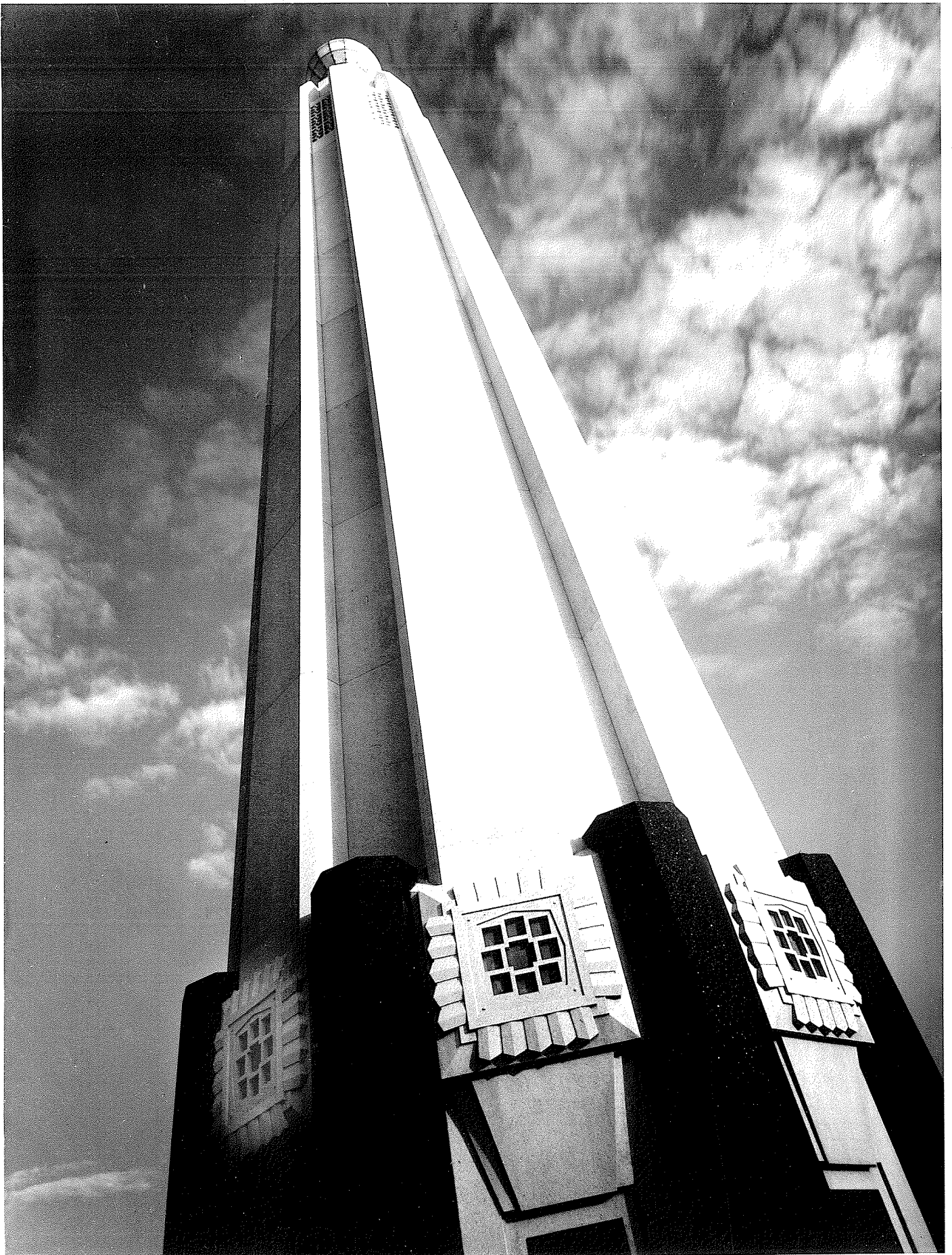
Edison Tower Menlo Park, New Jersey