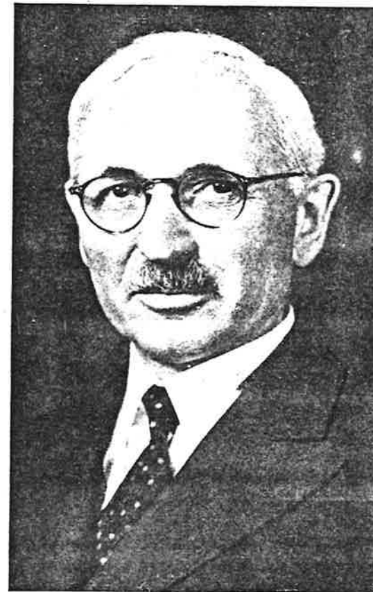
MYRON HUNT, F.A.I.A.