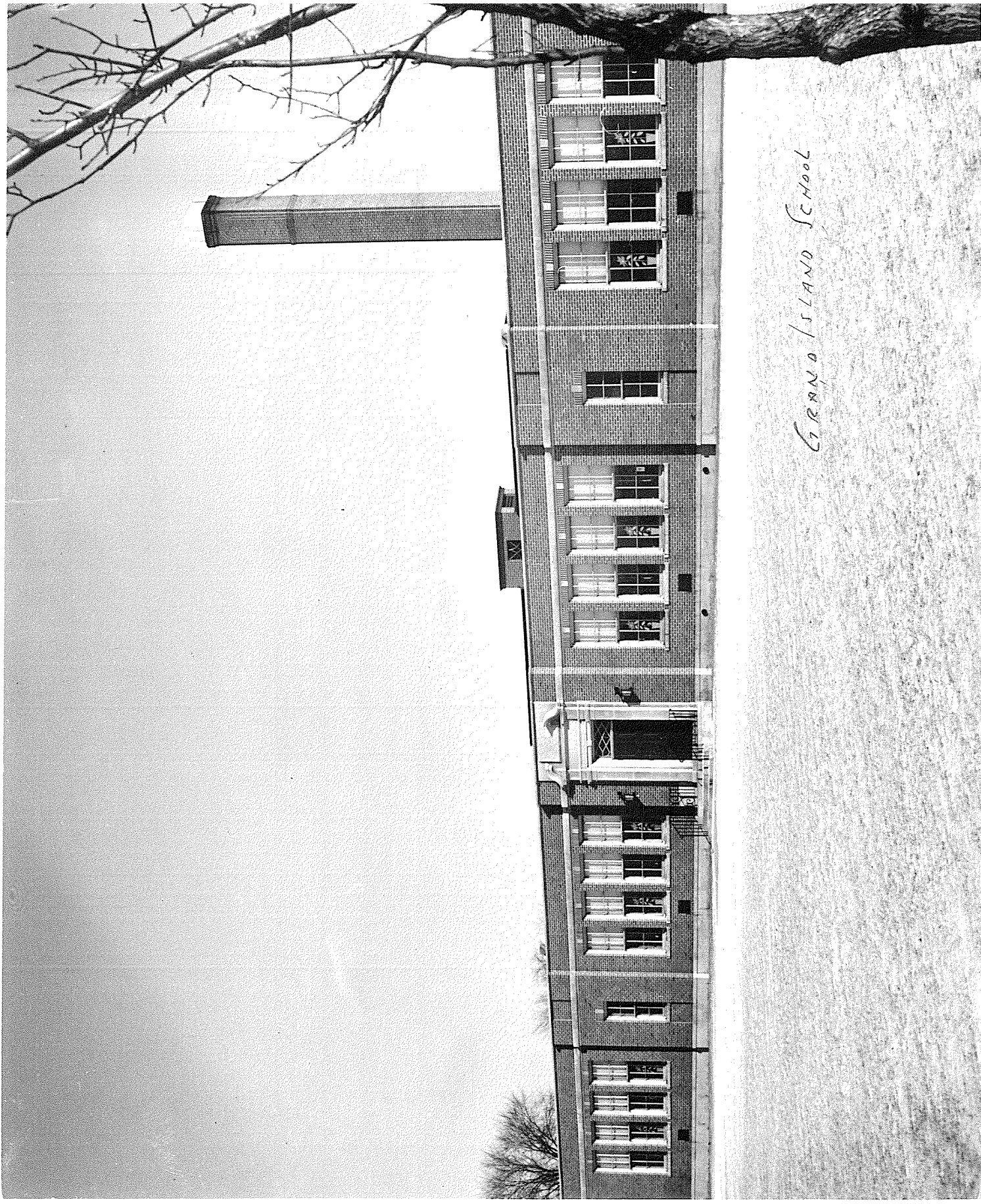
GRAND ISLAND SCHOOL