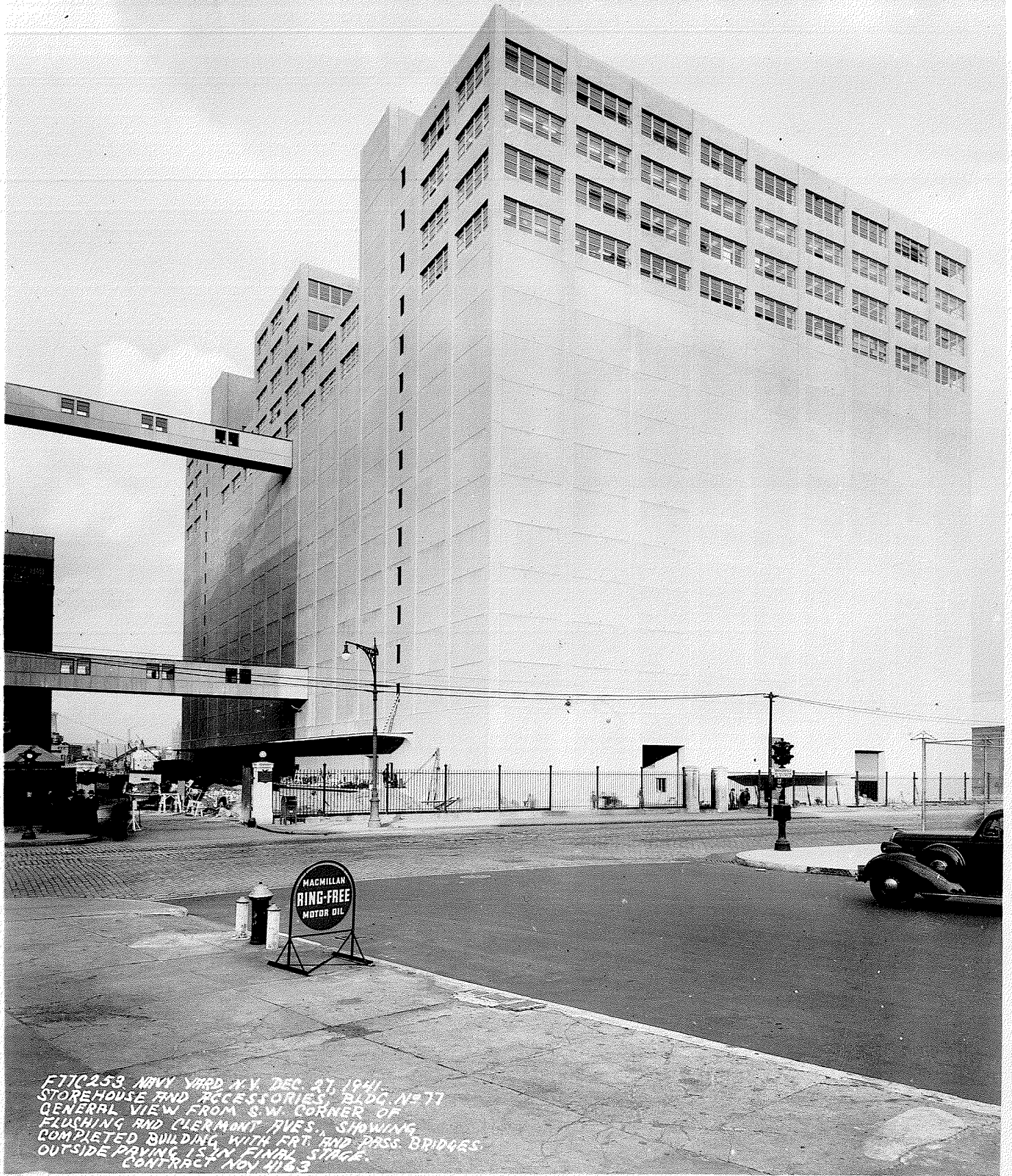
F77C253 NAVY YARD N.Y. DEC. 27, 1941. STOREHOUSE AND ACCESSORIES BLDG. NO. 77 GENERAL VIEW FROM S.W. CORNER OF FLUSHING AND CLERMONT AVES., SHOWING COMPLETED BUILDING WITH FRT. AND PASS. BRIDGES. OUTSIDE PAVING IS IN FINAL STAGE. CONTRACT NOY 41-3

THE AMERICAN INSTITUTE OF ARCHITECTS ARCHIVES For information or study purposes only. Not to be recycled, quoted, or published without written permission from the AIA Archives, 1735 New York Ave. NW, Washington, DC 20006