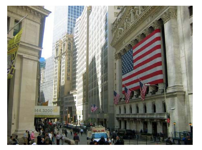
In 2015, we moved our office from the Meatpacking District to the heart of Wall Street.

The Move From The Meatpacking District To Wall Street