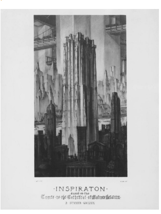
Illustration By A Young Barney Gruzen For A Competition