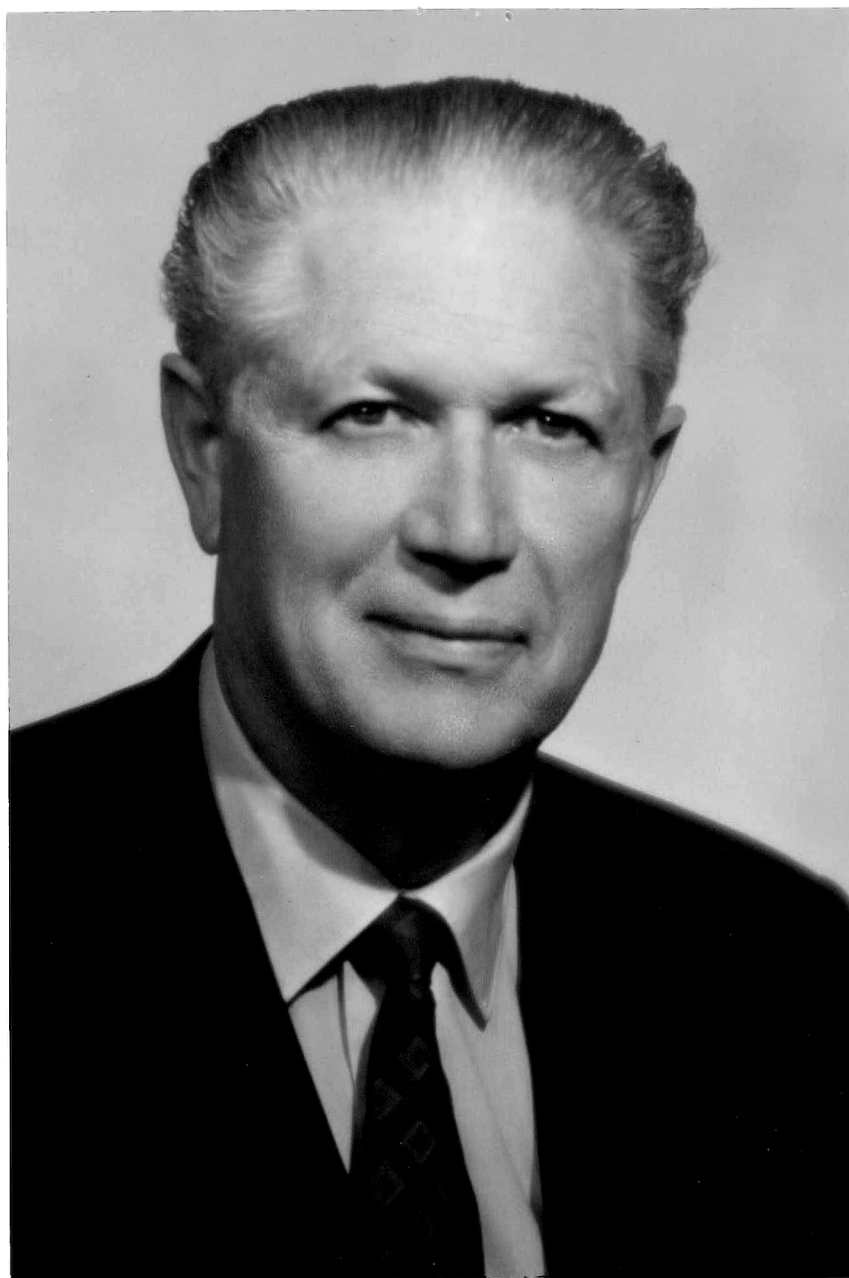
NOLA BROOKS STUDIO 455 F. O. B. Bldg.