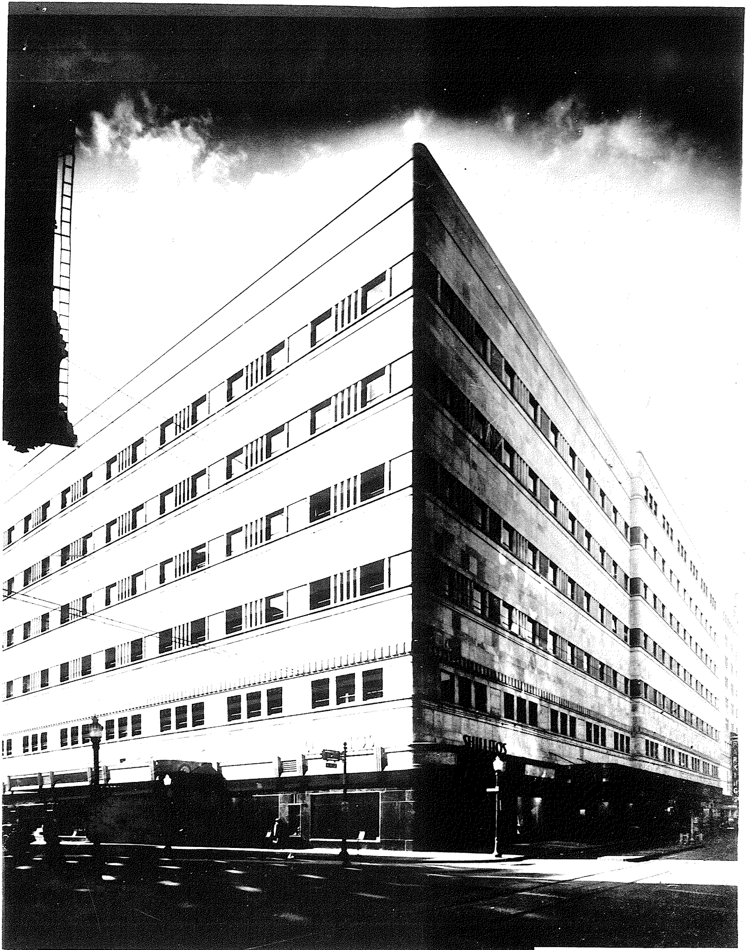
SHILLITO DEPARTMENT STORE

THE AMERICAN INSTITUTE OF ARCHITECTS ARCHIVES For information or study purposes only. Not to be recycled, quoted, or published without written permission from the AIA Archives, 1735 New York Ave. NW, Washington, DC 20006